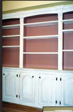
Make standard built-ins fabulous with custom color and antiquing.

Let me customize your home and favorite spaces with many different types of faux finishing to give you the look and feel of venetian plaster, denim, marble and much more!