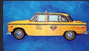
4' x 7' taxi mural