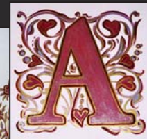
This fairy tale princess room has hand painted murals enhanced with a gold outline, over beautiful rose colored walls.