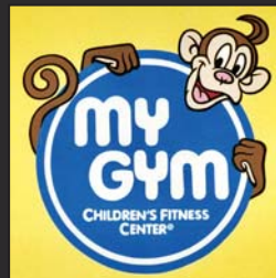
I also do logo and sign work. Actual size of the My Gym logo (above) is 8' x 8'.