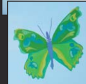
The vaulted ceiling and loft space provided the perfect lair for this 7' tiger and billowy clouds, where 26 butterflies dance throughout the room.