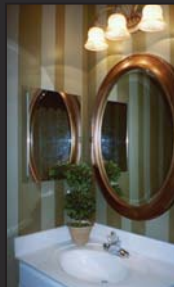
Stripe the walls in your bathroom for elegance!