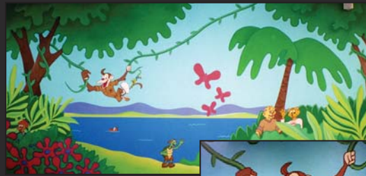
My Gym, Childrens Fitness Center of Leesburg, VA. Actual size of the mural is 12' x 26'.