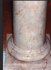
Turn boring white columns into expensive stone!