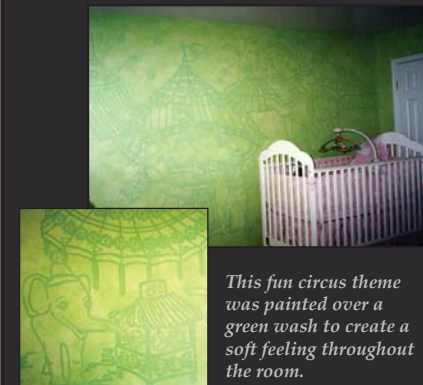
This fun circus theme was painted over a green wash to create a soft feeling throughout the room.